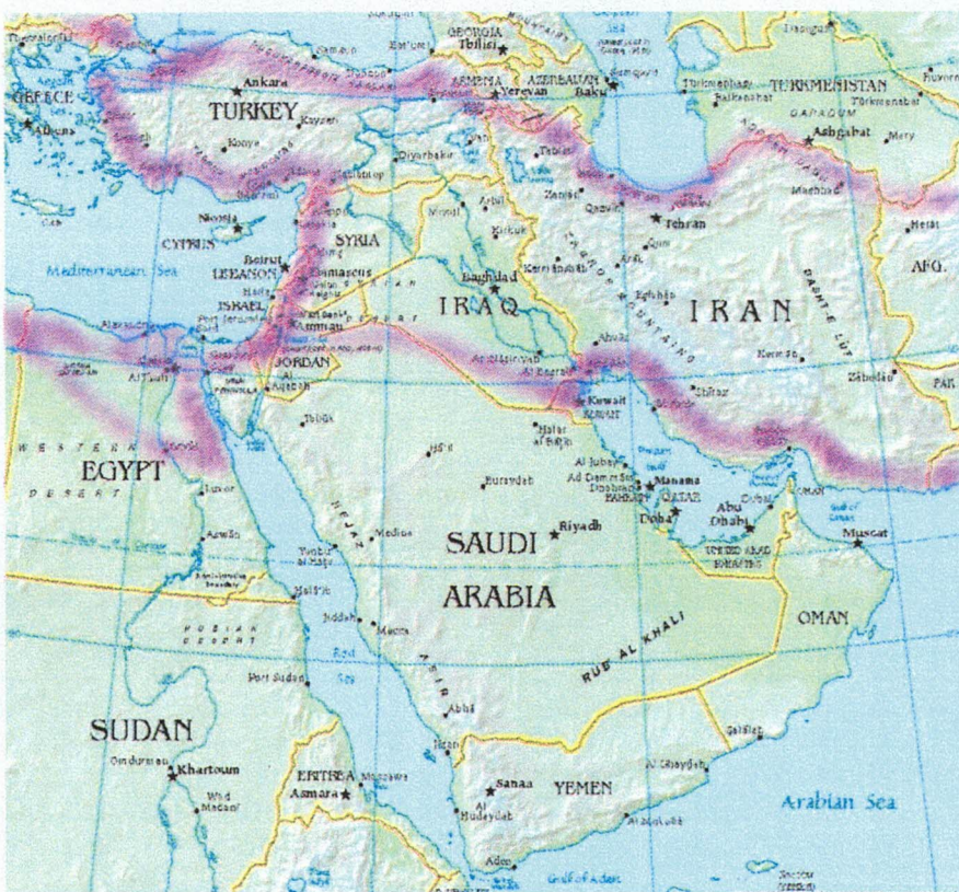
Above: The Persian Empire in Daniel's time (shown in purple).

On his death (at the age of 33, supposedly of a broken heart because there were no more territories to conquer!), his empire was divided into four sections by the generals of his army (as prophesied in Dan 11:4 and corresponding roughly to the four personages we meet in Daniel's prophecy).